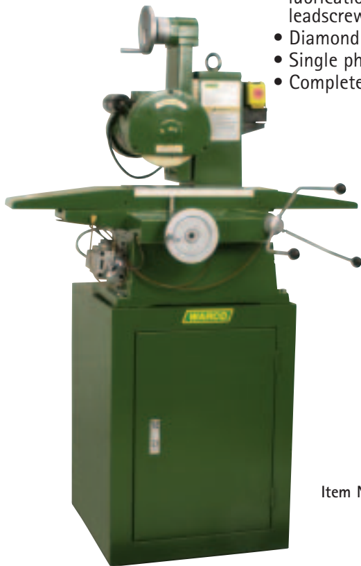
Item No. 2013YZ